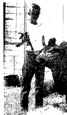
This Angus Heifer was fed GOOCH'S